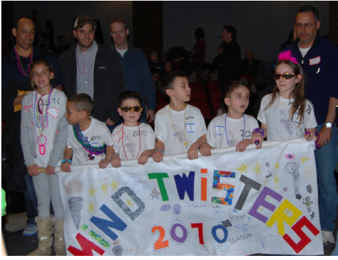
Team #2070, The Mind Twisters, of Dix Hills, pose at the Jr. FLL parade during SBPLI's Jr. FIRST LEGO League Expo.