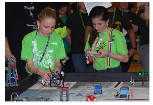
Team #4406, Smart Cookies, of the Girl Scouts of Nassau County, gear up for their match at the SBPLI FIRST LEGO League Long Island Championship Tournament.

This year's Jr. FLL challenge was DISASTER BLASTER<sup>SM</sup>, in which children ages six to nine explored awe-inspiring storms, quakes, waves, and other natural disasters as they built a model made of LEGO® elements with a motorized part. They also presented a "Show Me" Poster, in which students exhibited their research about natural disasters, how technology can help respond to natural disasters, and how first responders use this technology.