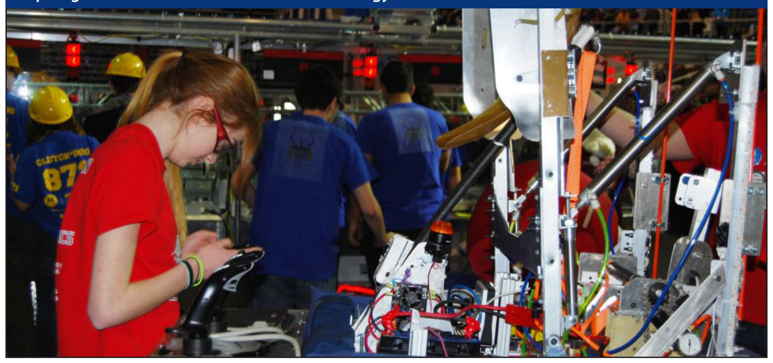
A team member from the Mechanical Bulls of Smithtown, FIRST Team #810, gears up for an intense match at the School-Business Partnerships of Long Island, Inc.'s Long Island Regional FIRST Robotics Competition.