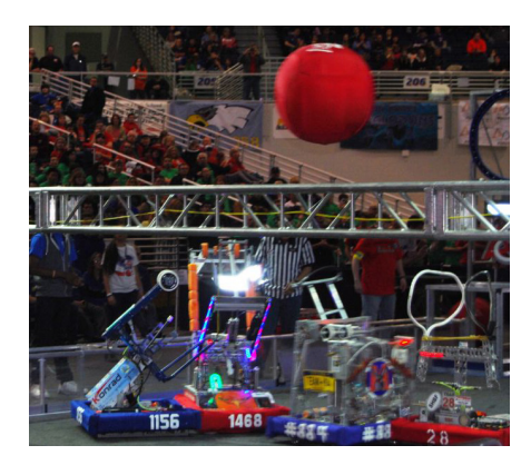
A robot from Pierson High School FIRST Robotics Team #28 hurls the ball over the truss past the robots from Marista Pio XII High School FIRST Robotics Team #1156, Hicksville High School FIRST Robotics Team #1468, and Malverne High School FIRST Robotics Team #884 during a match at the Long Island Regional FIRST Robotics Competition.

SBPLI is currently seeking local businesses for sponsorship opportunities for the 2015 Long Island Regional. For more information, please visit www.sbpli.org.