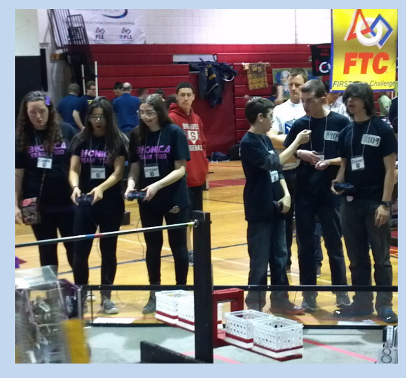
Members of Team #7120 "Bionica" (left) steer their robot while the members of Team #8109 "Beta Testers" (right) confer with each other during the FIRST Tech Challenge at Syosset High School.

Following the tournament, an award ceremony was presented by the FIRST judges. Different teams won trophies for various categories that represented a range of qualities, such as teamwork, creativity, and inspiration. The winners are listed below: