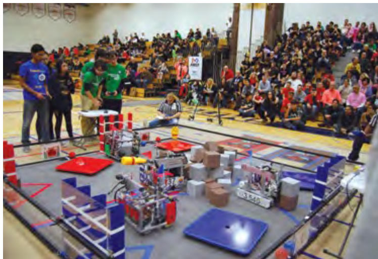
The alliance of FIRST ® Tech Challenge Team #4137 "IslandBots" (left) and Team #9421 "Hydrofluoric Robotics" (right) compete in a match at the FIRST Tech Challenge Long Island Championship.

In FIRST RELIC RECOVERY, teams battled in an alliance format on a 12-foot-by-12-foot field as their robots attempted to retrieve opponent-colored jewels from platforms, score glyphs into crypto boxes, create cipher patterns, move "relics" to a recovery zone and park their robots on "balancing stones."