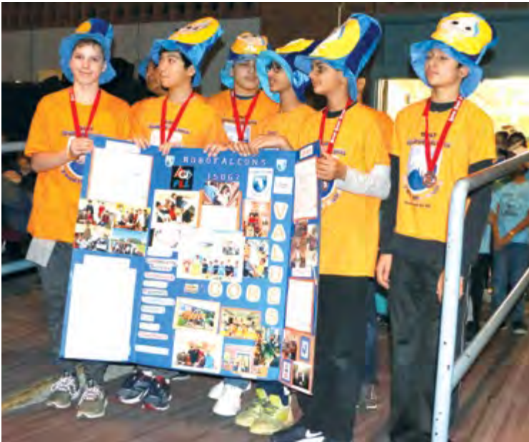
FIRST ® LEGO ® League Team #15067, the “RoboFalcons” of Jericho, pose with their project as they are waiting to be called to come down to the auditorium at the awards ceremony of the FIRST ® LEGO League Long Island Championship.

Following a series of six qualifiers, 40 FIRST ® LEGO ® League teams from across Nassau and Suffolk Counties took part in the Long Island Championship at Longwood High School on March 4. This season’s challenge was FIRST HYDRO DYNAMICS SM .