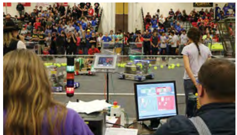
Teams, mentors, volunteers and their families turned out in strong numbers for last season’s Half Hollow Hills Invitational.

During the event, students and coaches from 24 Long Island school districts participated in an enjoyable and engaging learning environment that enhances problem-solving skills, cooperation and teamwork. Participating teams competed under the rules and guidelines of the 2017 FIRST Robotics Competition challenge, dubbed FIRST STEAMWORKS ™ . Residents, teachers, administrators and business leaders from the surrounding areas attended, discovering first-hand the benefits that FIRST Robotics programs provide to students.