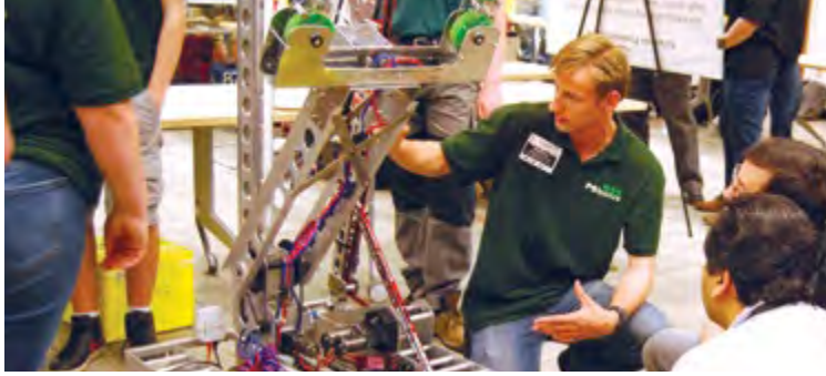
Members of the Lindenhurst High School "PSIcotics" present their robot to a Zebra Technologies employee at the company's robotics invitational on May 24.