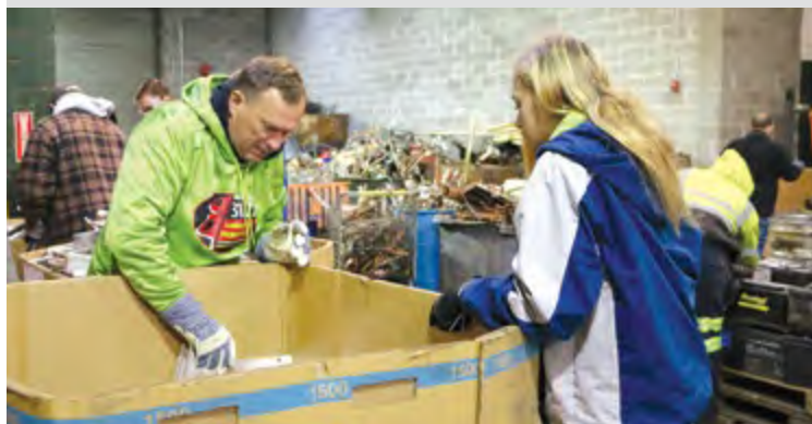
Members of the Westhampton Beach "Hurricanes" participate in Gershow Recycling's Scrap Metal Day.

For nearly a decade, Gershow Recycling has opened its Medford facility to local FIRST ® Long Island robotics teams, including coaches, students and their parents, to enable the teams to collect aluminum scrap metal. This season, 16 teams benefitted from Gershow's Scrap Metal Day.