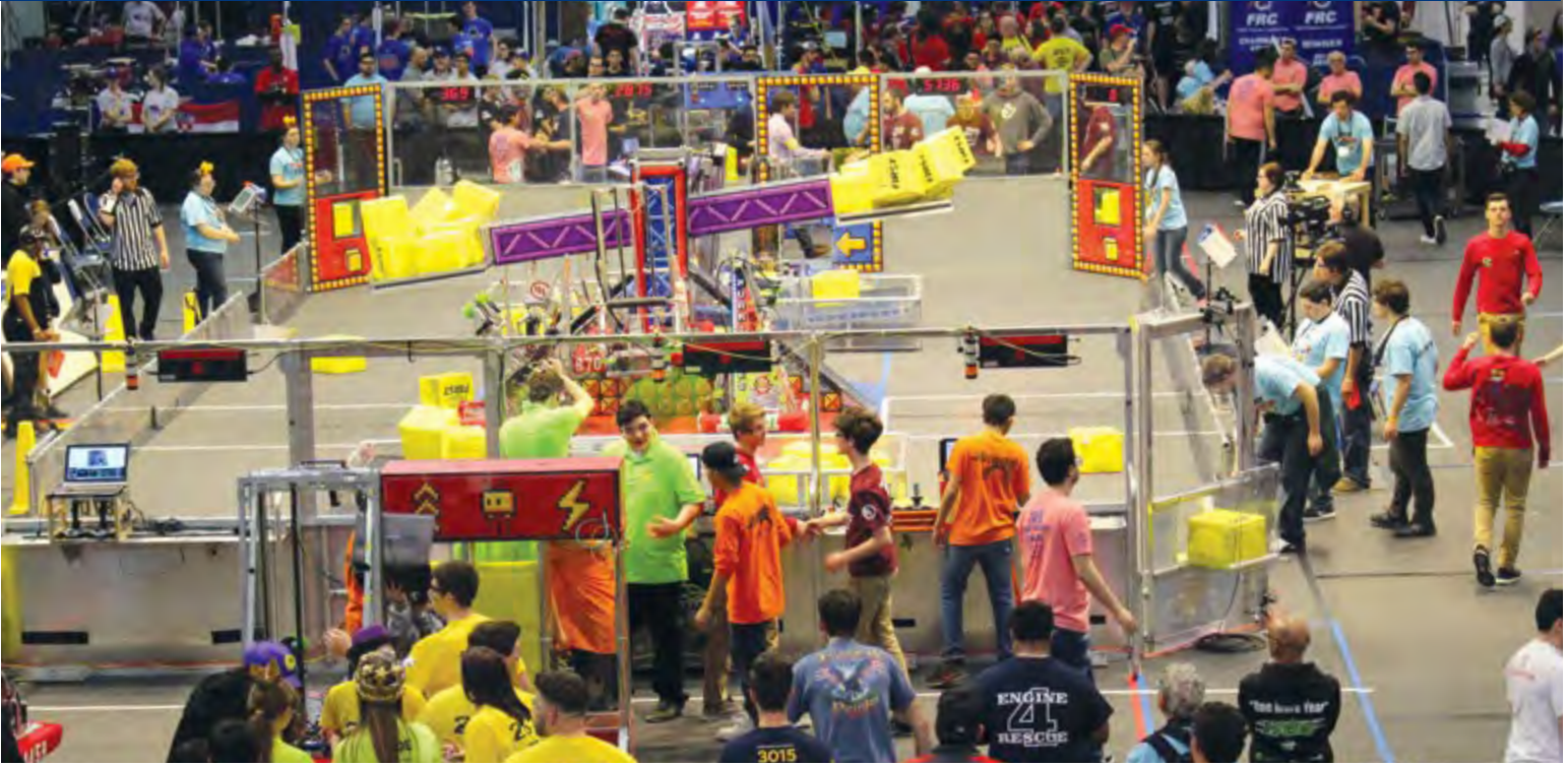
Families, participants, mentors and volunteers cheer as teams from around the world compete during one of four days of the dual competitions.