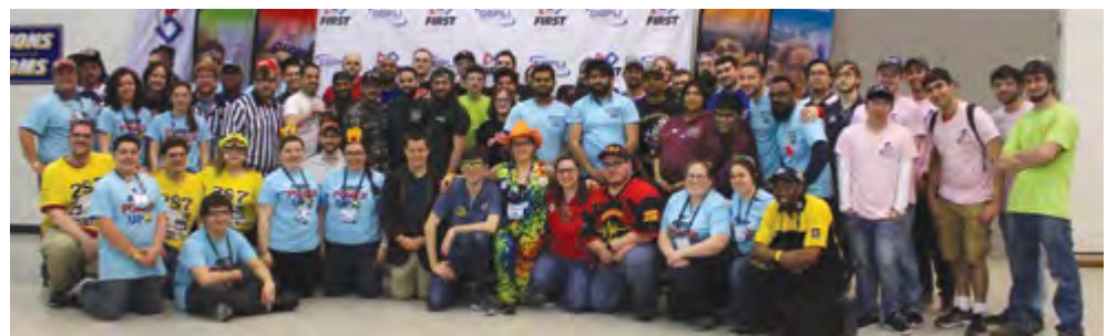
The collective of alumni who volunteered on Day 2 of the SBPLI Long Island Regional #1.