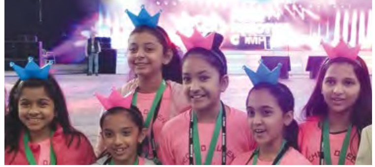
The Techno Queens on stage at the FIRST World Festival.