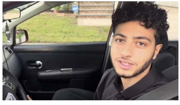
Stony Brook student wins $100G in football tosses for tuition