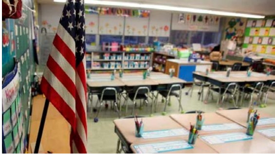
Secrecy in our schools: Newsday Investigations