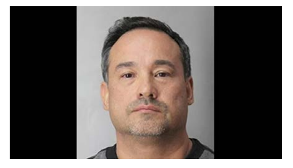
School bus driver charged with allegedly raping, kidnapping teenage student